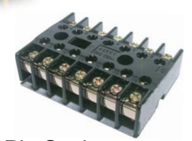
14 Pin Socket

Struthers-Dunn relays have been tested as suitable for Class 1E service in nuclear power generating stations.